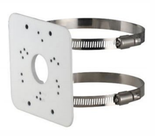
CP-UA-B2P Pole Mount